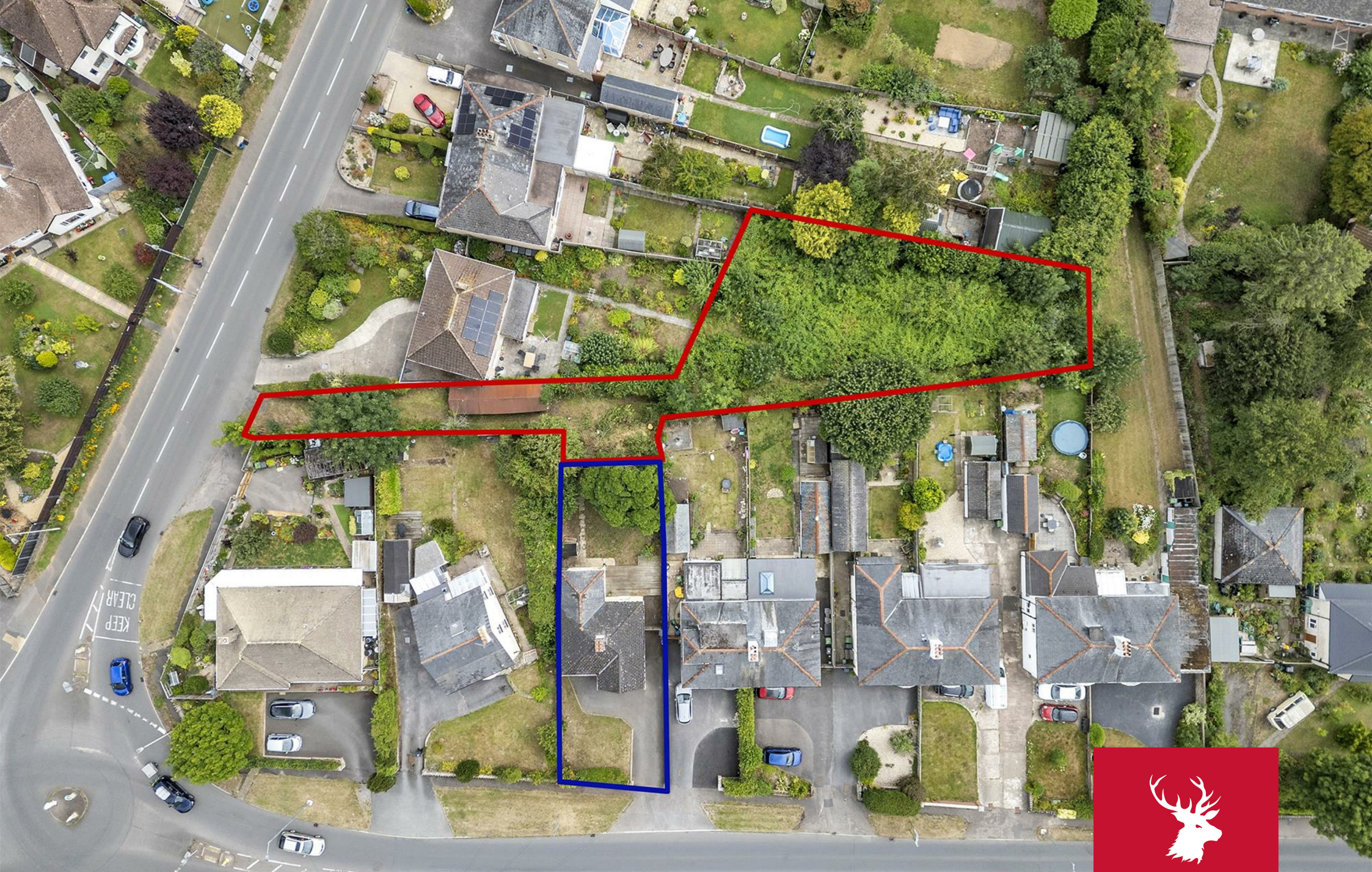
House and Plot at Crosslyn